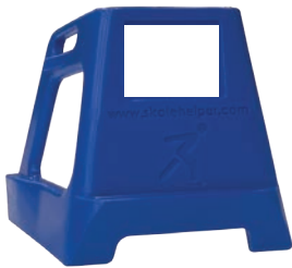
Skate Aid $150.00

Skate aids are used to help beginner skaters keep their balance while they are learning to skate. These aids are used during every public skate and skating party and can be used whenever the ice is rented. Ad size is 8.5" x 11".