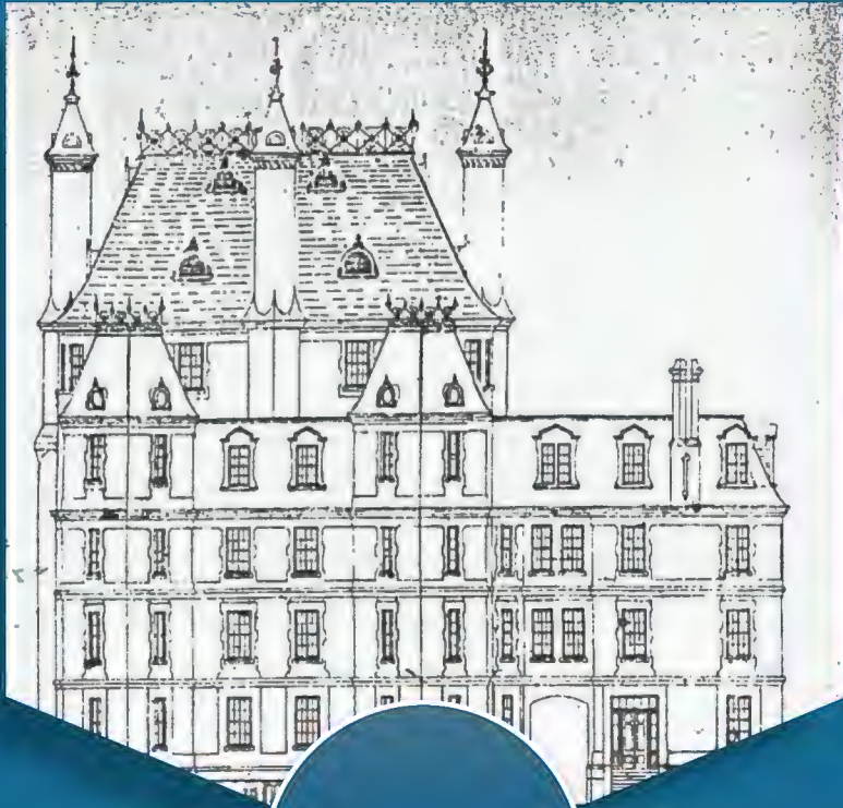
Fairview Historical Society