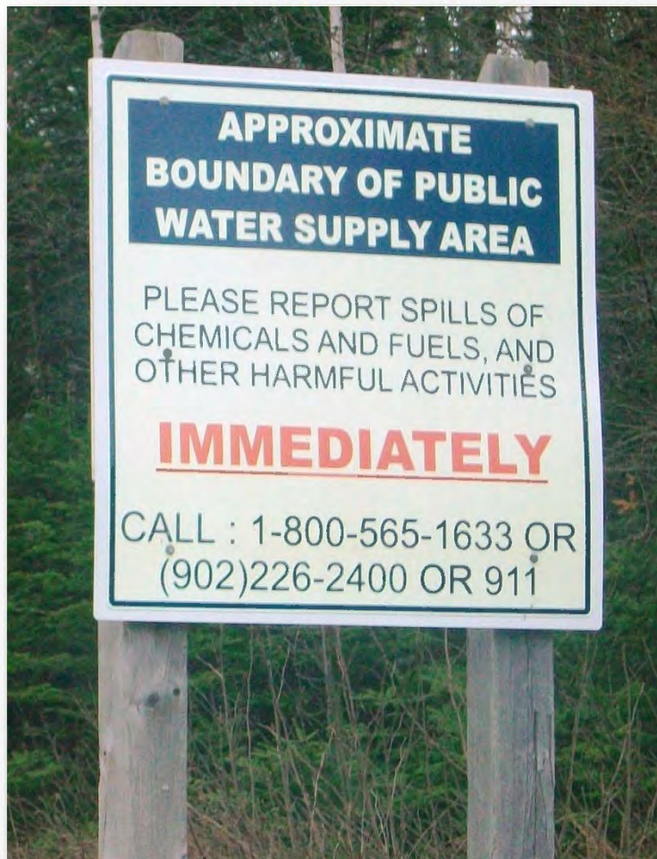
Figure 3 - Water Supply Sign:

In addition to posted signs, Municipal Staff has sent letters to owners of properties located within the water supply areas. These letters serve to remind property owners that they are within the water supply area and advise these owners to take precautions to protect the supply. Figure 4 shows a typical letter.